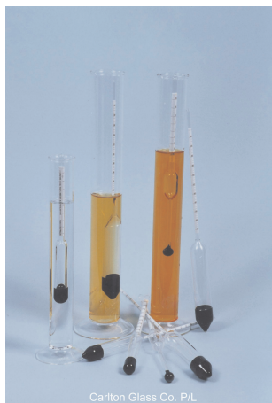
Carlton Glass Co. P/L

Carlton can supply a wide range of glass instruments and other laboratory glassware specifically for the Petroleum Industry. If the item you require is not shown, please contact us for a quotation.